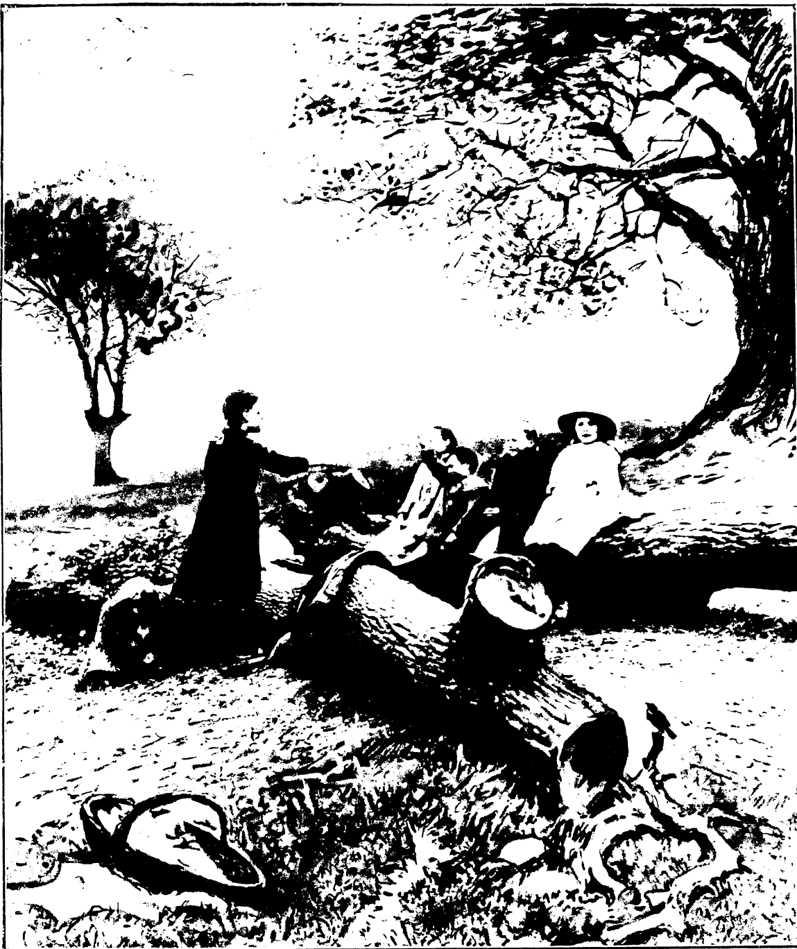
THE OPEN AIR CLASS