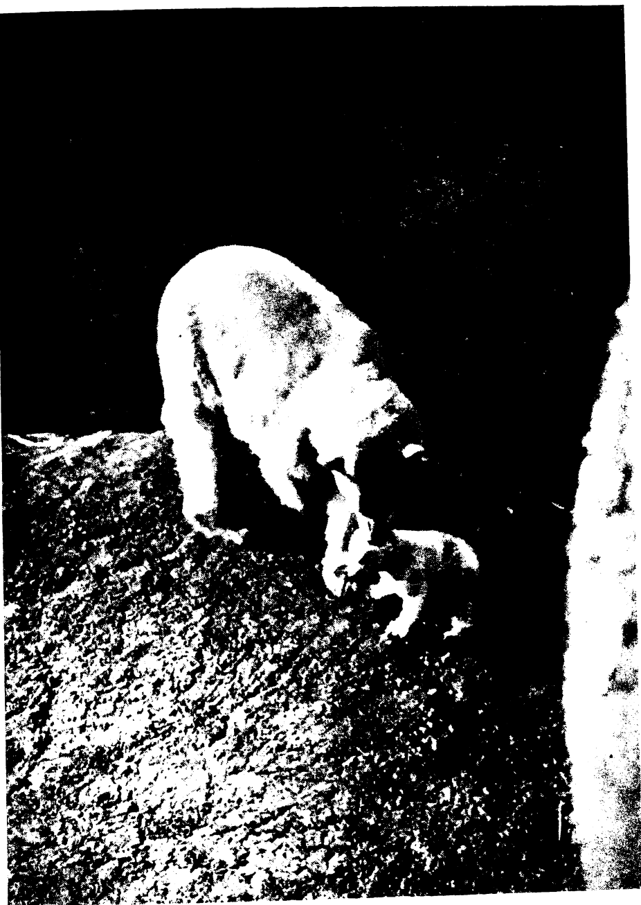
Mother carries Brumas — three months old — into the sunshine.