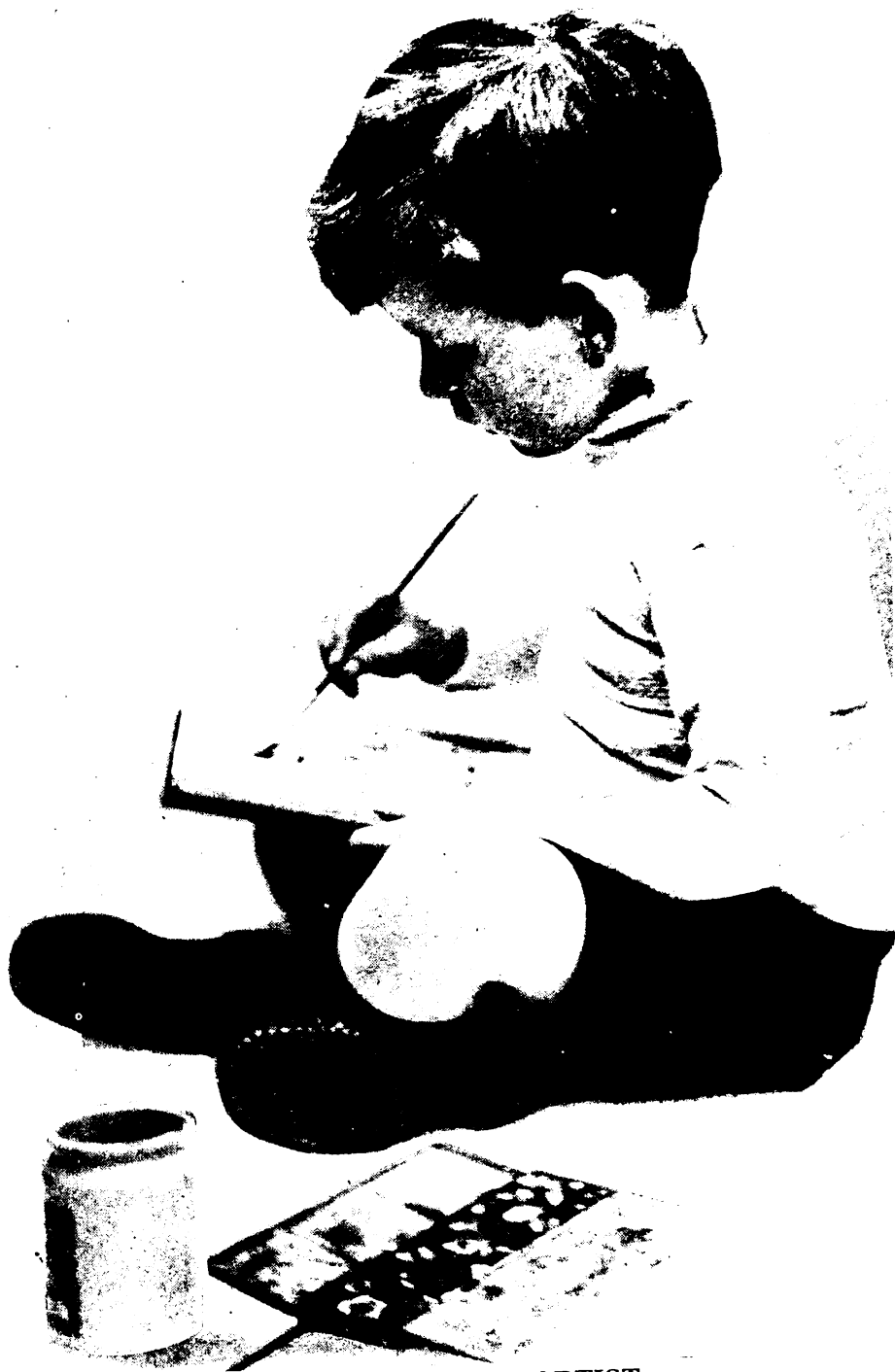
A PROMISING ARTIST