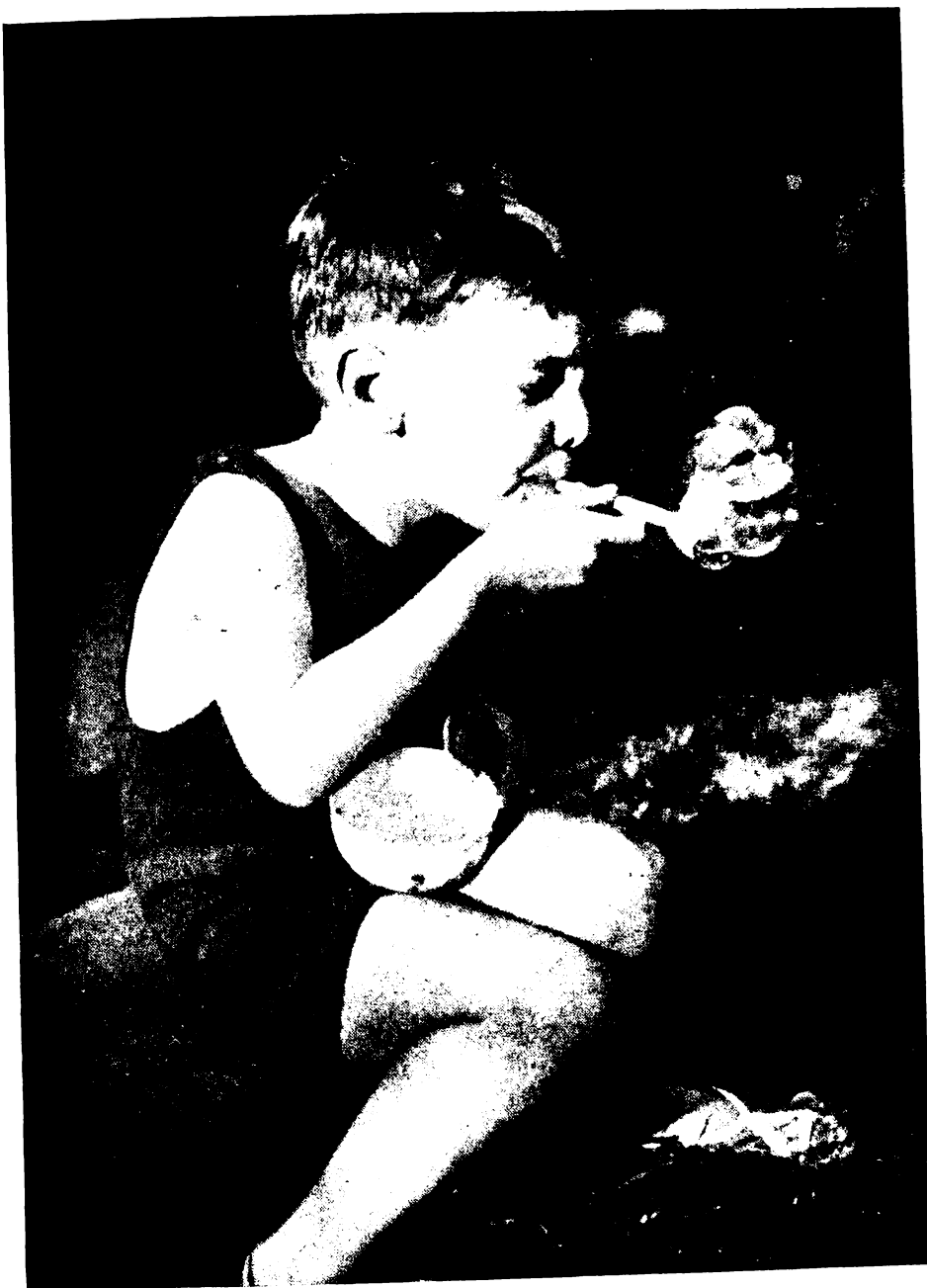
THE BUBBLE BLOWER