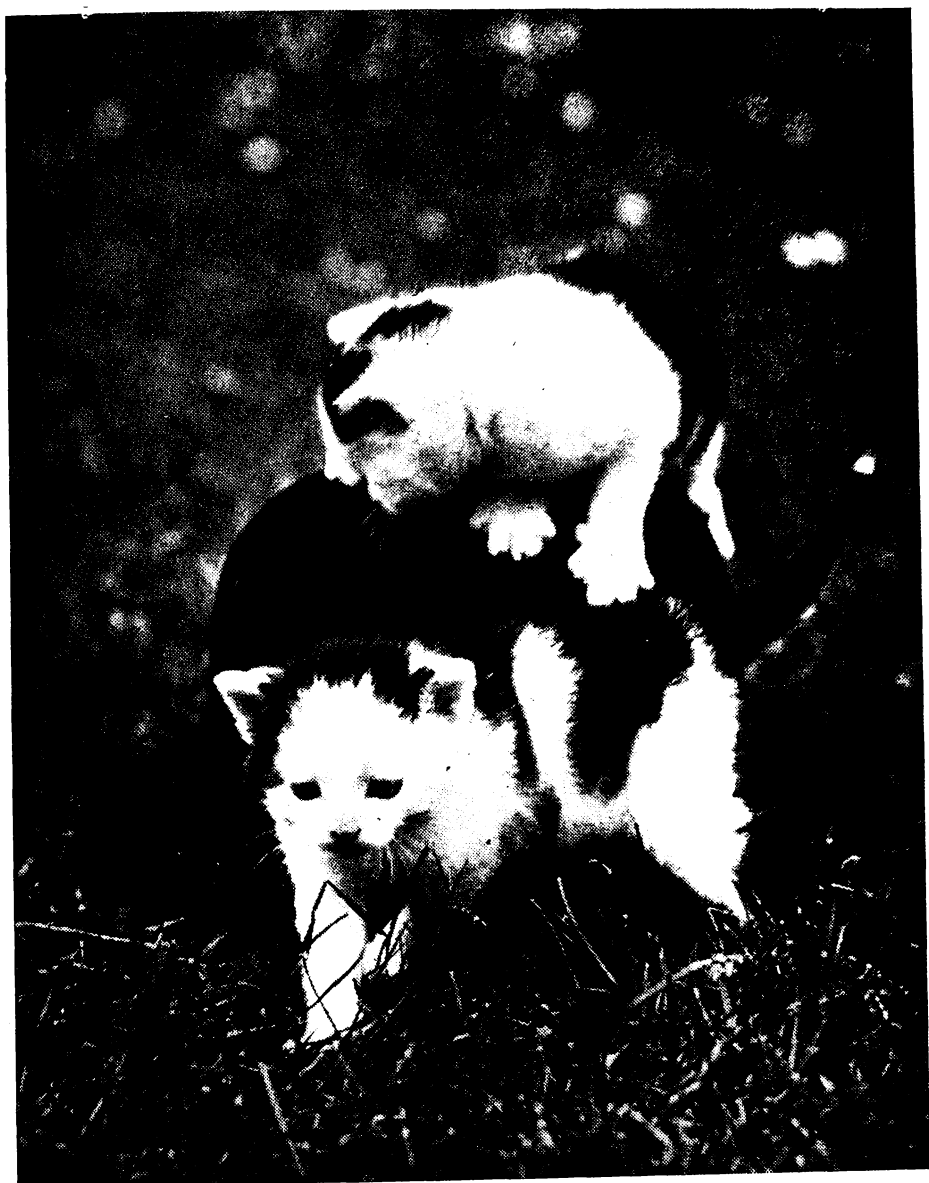
TWO LITTLE MISCHIEFS